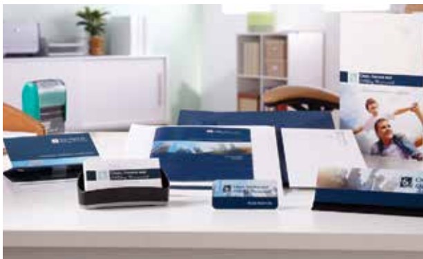
Copying, printing, binding and finishing services

Office Depot® is proud to offer CO+OP members significant savings through our new national account agreement. The agreement provides outstanding value on the following: