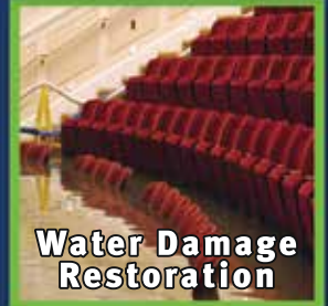
Water Damage Restoration