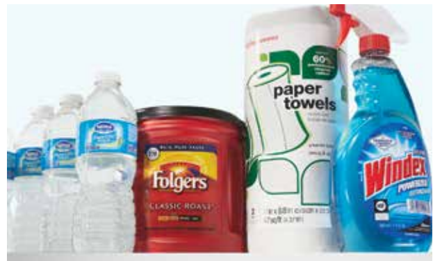
Coffee & breakroom solutions