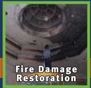
Fire Damage Restoration